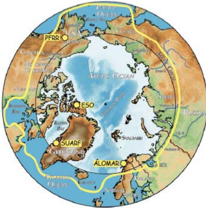
Fig 1. Location of observatories in Arctic Rayleigh lidar network. The four sites are at Poker Flat Research Range (PFRR), Eureka Stratospheric Observatory (ESO), Sondrestrom Upper Atmospheric Research Facility (SUARF), and Arctic Lidar Observatory for Middle Atmosphere Research (ALOMAR). Yellow boundary shows the Arctic Monitoring and Assessment Boundary. Adapted from SEARCH [2005].