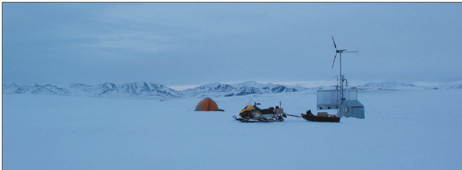
One of two solar and wind power systems currently at Imnavait Creek. As a pilot project this summer, CPS will install a methanol fuel cell at the adjacent site. The intent of the project is to improve data communications for both research sites by providing a more constant source of power while beta testing new technology in a field setting.