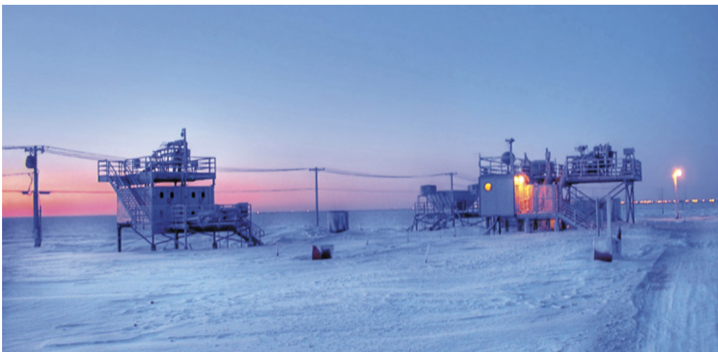
An Atmospheric Radiation Monitoring sensor array outside of Barrow, Alaska.