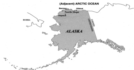
Research facilities are located at various places on Alaska's North Slope, including the towns of Barrow, Atkasuk, and Oliktok Point.

Climate Security program strive to understand and prepare the nation for the national security implications of climate change. The program focuses on four specific areas: sensing and monitoring, modeling and analysis, carbon management, and water. Much of the sensing and monitoring component focuses on the Arctic, via the Atmospheric Radiation Monitoring (ARM) Climate Research Facility.