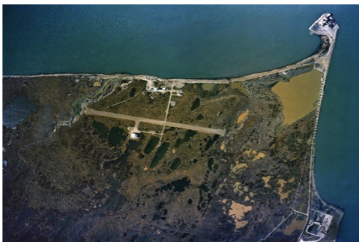
USAF Oliktok Point Long Range Radar Station which serves as the base for ARM's mobile research facility at Oliktok Point, a location for ARM NSA field campaigns requiring restricted airspace.

The North Slope of Alaska (NSA) ARM site at Barrow has been the base for many research efforts including the Surface Heat Budget of the Arctic (SHEBA) project, in which an icebreaker was intentionally embedded in a large ice floe and drifted with the pack ice; and the Mixed-Phase Arctic Cloud Experiment (M-PACE), which used an instrumented tethered balloon as well as instrumented aircraft to acquire data from arctic clouds.